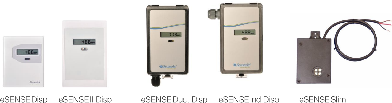
Figure 1: Housing options